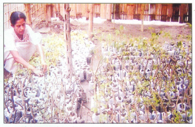
Woman's participation in Kisan nursery