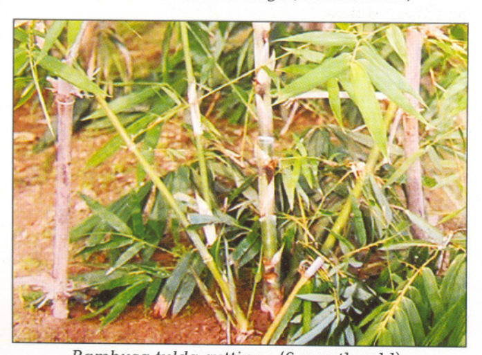
Bambusa tulda cuttings (6 months old)