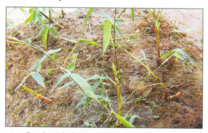
Bambusa balcooa cuttings (3 months old)

A base population of the plus clumps of the different species of Bambusa balcooa, Bambusa tulda, Bambusa nutans and Dendrocalamus hamiltonii was produced and are being maintained in the nursery. About 1727 ramets of 33 plus clumps of Bambusa balcooa, 802 ramets of 36 plus clumps of Bambusa tulda, 1038 ramets of 13 plus clumps of Bambusa nutans and 166 ramets of 9 plus clumps of Dendrocalamus hamiltonii are being maintained in the nursery.