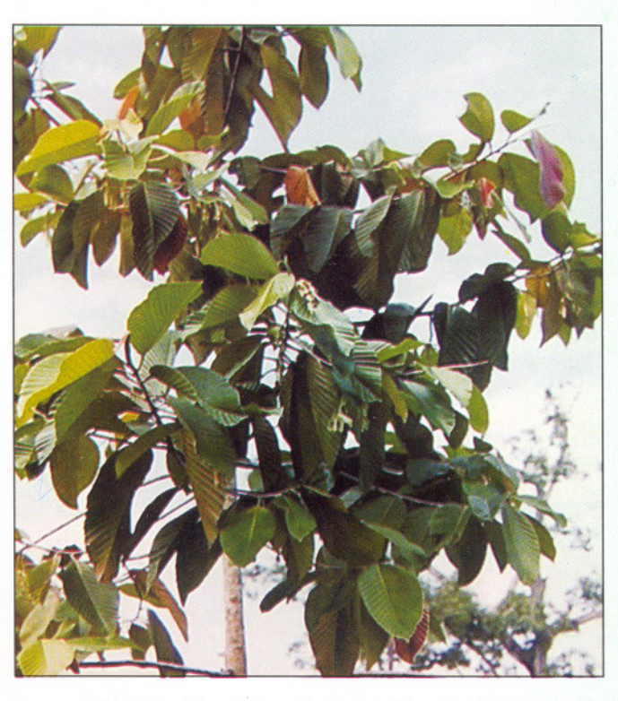
Profuse flowering in juvenile plant of Dipterocarpus retusus

Status: The Seedling Seed Orchards (SSO) at Deovan and Nahorani were studied for various growth parameters. A profuse flowering was observed in juvenile stage of some progenies, planted at Deovan campus.