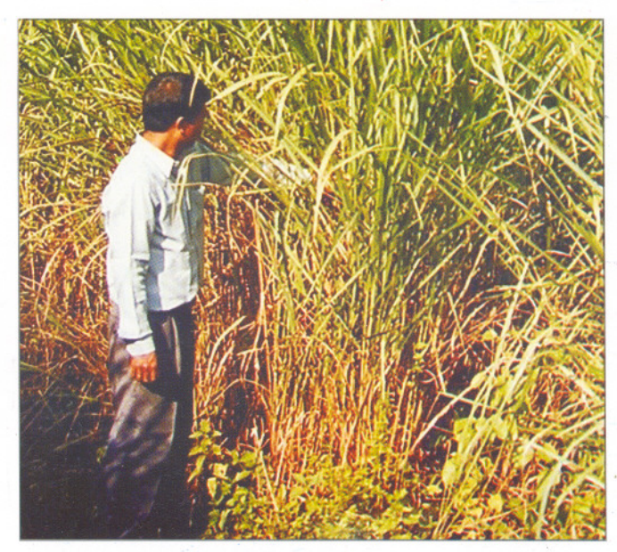
Ground Orchid (Calanthe masueca) of Kaziranga National Park