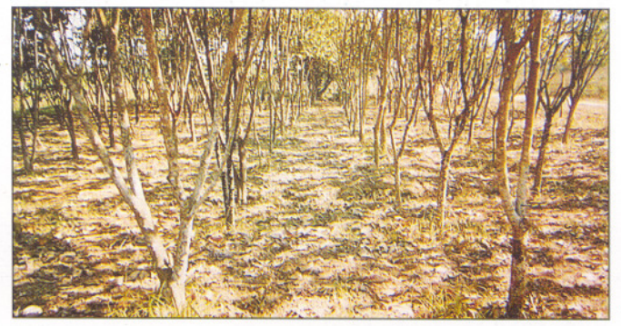
A view of three years old Mallotus albus growing under energy plantation

Status: A total of ten species were selected from the plantation already established in the Naharoni Research Station of the Institute. for study. Growth data was recorded at six monthly intervals and component wise biomass was calculated annually. Parameters like growth, biomass, moisture content and energy value, etc. are being analysed.