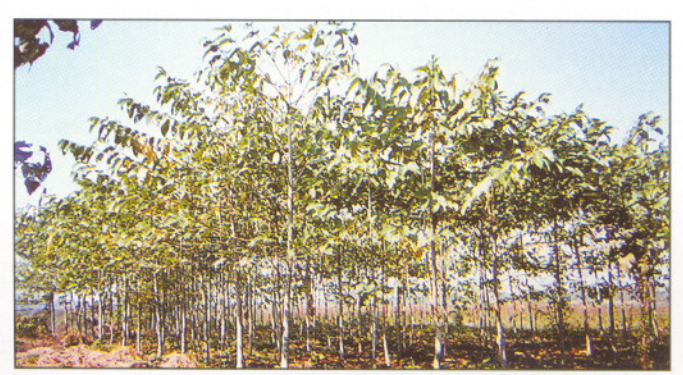
A view of three years old Anthocephalus chinensis growing under energy plantation

Project 5: Reclamation of highly eroded site of Cherapunji, Meghalaya [RFRI/SM/04/2003-2006]