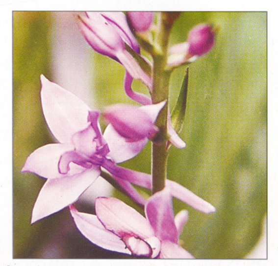
Grassland dominated with Phragmites karka Kaziranga National Park

Status: The permission from Govt. of Assam to conduct research in the KNP was received in the last week of October. Topo- sheets (1:50000) and maps of area have been collected. Study sites in the park have been selected. Enumeration of vegetation and grassland is in progress. Vegetation survey, laying out permanent plots 100 m x 100 m in woodland, 50m x 20m plot in grassland have been initiated. Plant samples are being collected and enumeration of species is in progress. About 10 species of important orchids have been collected for conservation.