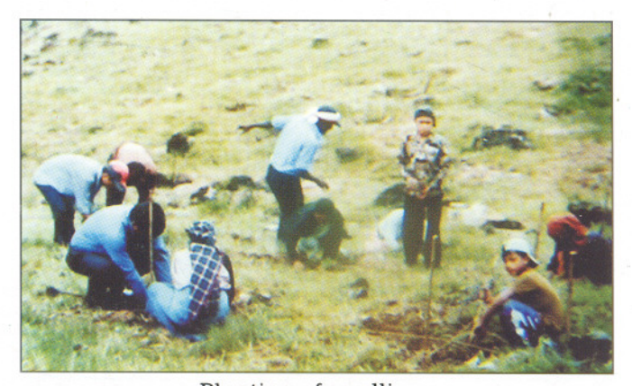
Planting of seedlings

Status: 22.52 ha land was acquired from Meghalaya Forest Department, 1.5 ha was fenced, physiographic data were collected, possibilities were explored for collaboration with the department and NGOs.