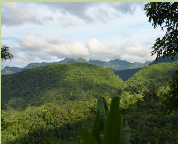
Landscape of REDD+ Himalaya project site