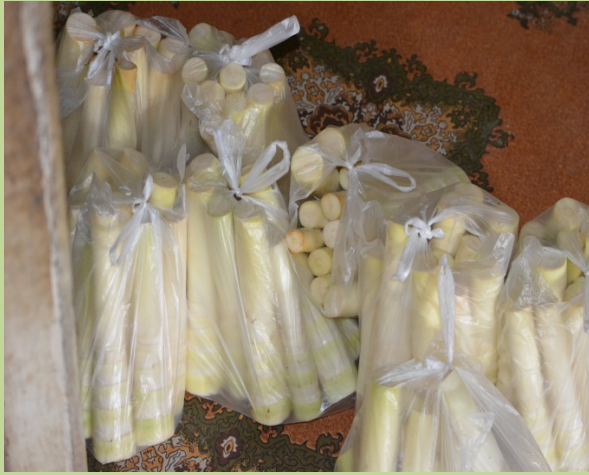
Bamboo shoots ready for market supply. This is the first harvest of shifting cultivation process