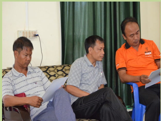
Village council members reviewing the cost and benefit questionnaire in Sihphir village.