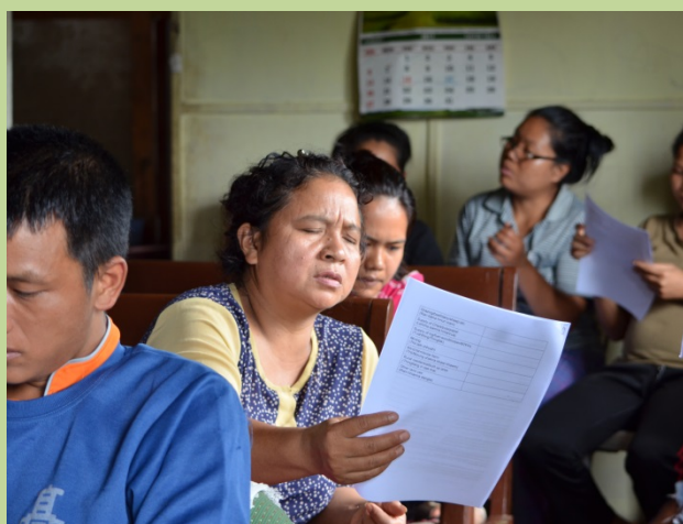
Local community in consultation meeting and busy in reviewing the questionnaire