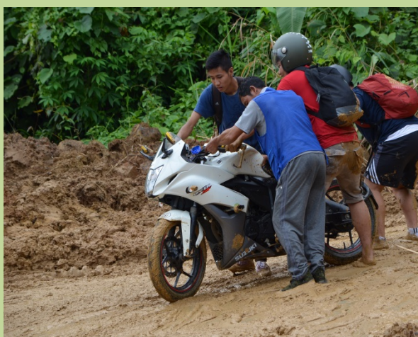
Road condition due to prolonged monsoon and landslides