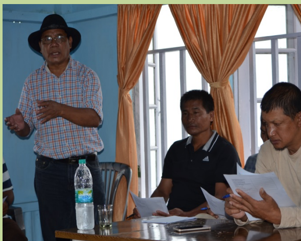
Facilitator explaining the questionnaires to community people in Mizo language