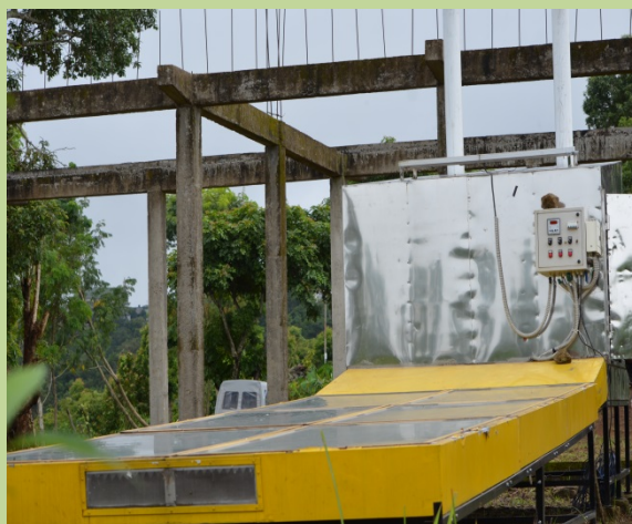
Solar dryer at Reiek village.