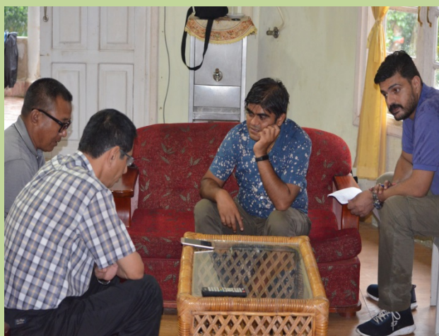
Field crew collecting information on the life story for shifting cultivation