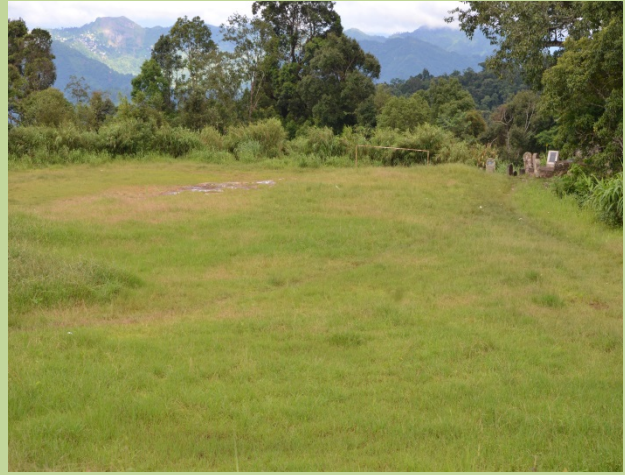
Proposed site for the installation of turmeric processing plant at Ailawng village.