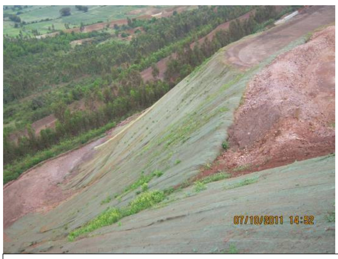
Geo-textile stabilization of steep slopes of OB dump of John mines of Chitradura