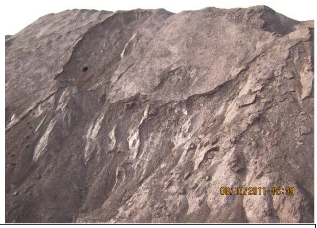
Erosion and improper stacking of fine ore material of Laxmi Narasima mines of Chitradurga