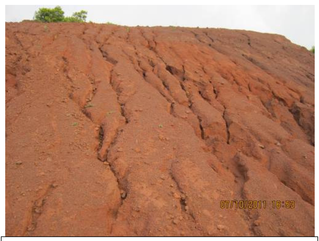
Unstabilized dump of MEL mines of Chitradurga