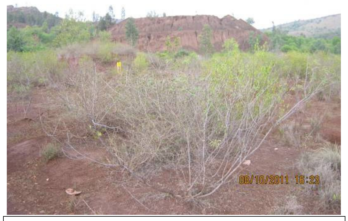
Unmanaged and abandoned OB dump of DRR mines, Chitradurga