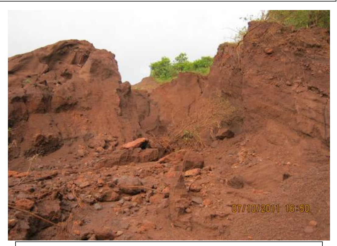
Breaching of OB dump of MEL mines towards forest in Chitradurga