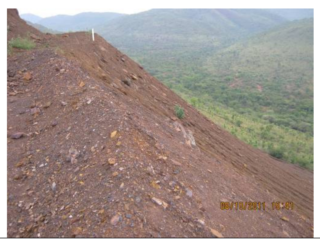
Unstabilized steep OB dump sliding towards vegetation of Allum Veerabhadrappa mines, Chitradurga