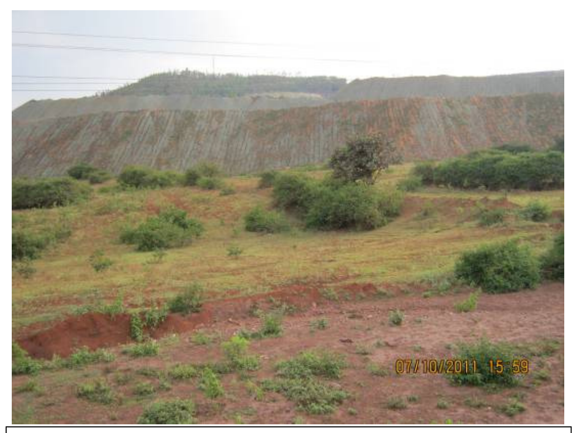
Geo-textile stabilization of steep slopes of OB dumps of Sea Goa mines of Chitradurga