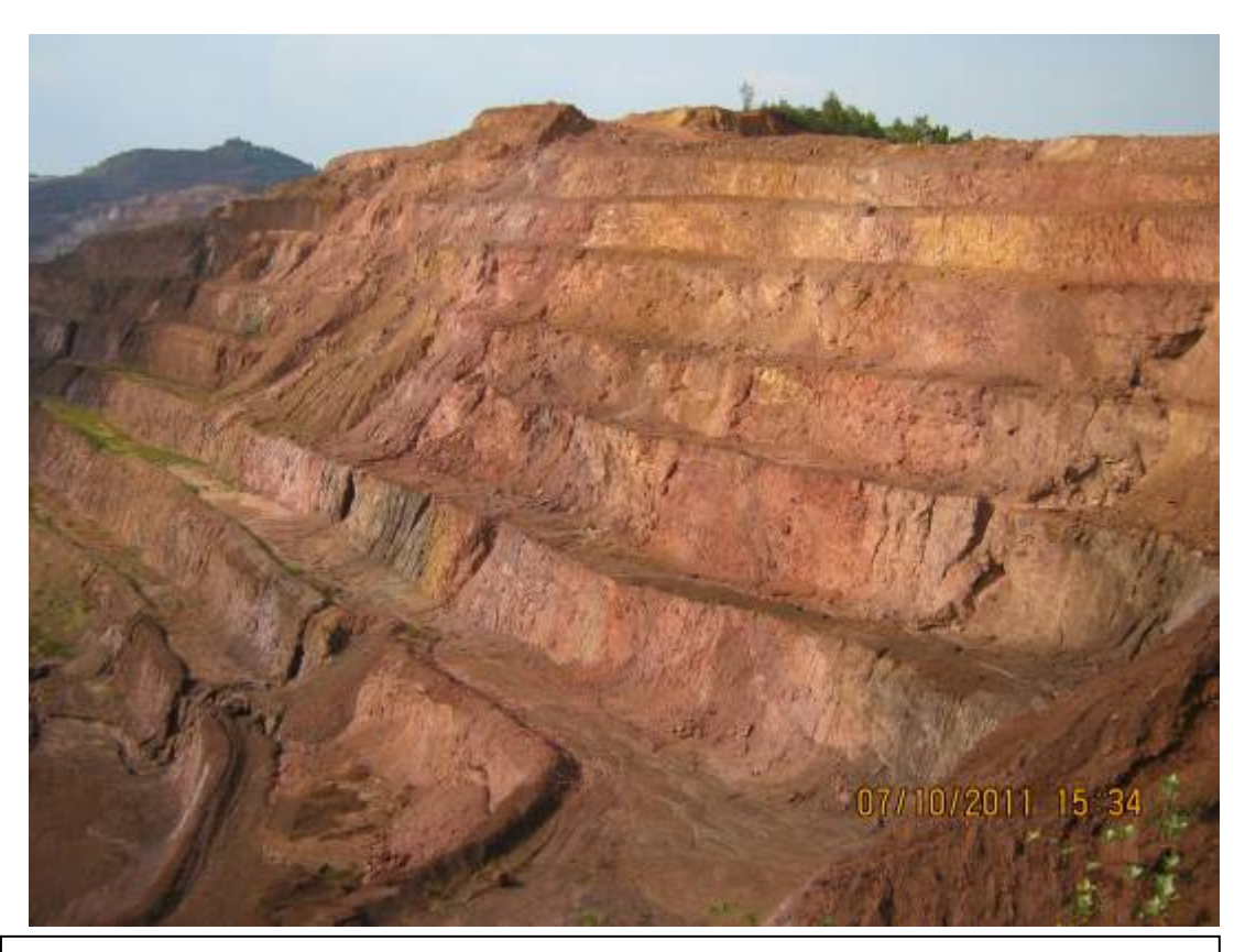
Sliding of mine benches due to unscientific mining of Sesa Goa mines of Chitradurga