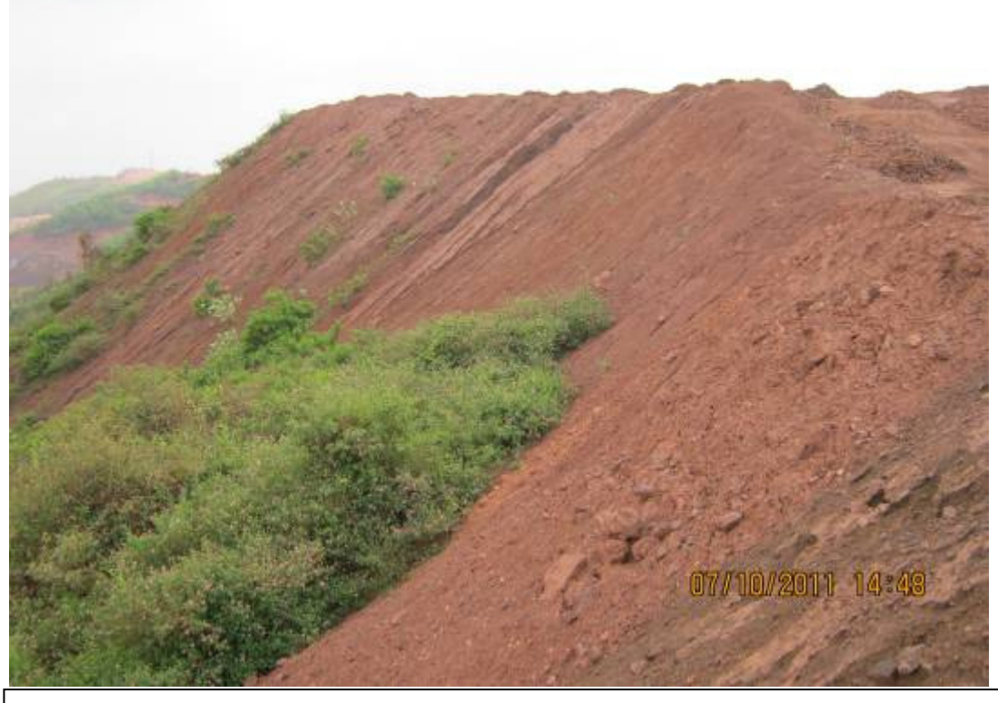
Steep slopes of OB dump of John mines of Chitradurga