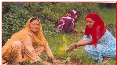
Women participation in plantation activities

Findings: The most preferred species of timber, fuel and fodder were documented by local people in different PFM areas of Himachal Pradesh. The role of woman in PFM was studied. It was found that as per the guidelines of VFDC formation under PFM, women were given due representation in the state of Himachal Pradesh. However, practically in the execution of work, their role was not up to satisfactory level except in few VFDs, such as, Dhalwan in Mandi Circle and Kohbag in Shimla Circle, etc. The Participatory Forest Management may not have achieved its objectives completely but it has brought positive change in mind frame and thinking of local people and field staff towards the forest conservation.