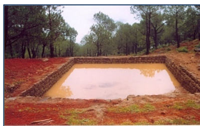
Water harvesting structure constructed