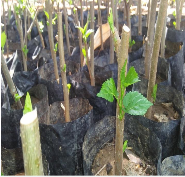
एम. अल्बा की क्लोनल नर्सरी