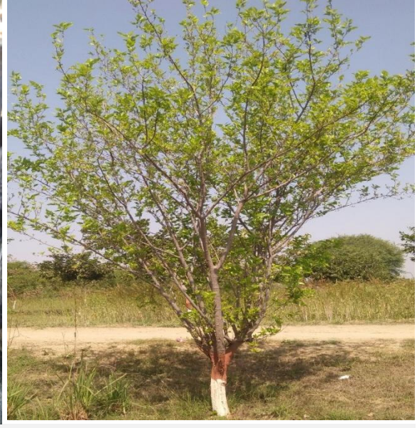
एम.अल्बा का परिपक्व वृक्ष