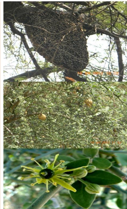
Photo. 3: Ecosystem service benefits from B.aegyptiaca in Indian Ravine lands

This species naturally shows wide variation and high adaptation under this harsh ravinous ecosystem as a tolerant, productive as well as restorative species to maintain other biodiversity too.