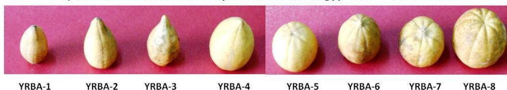
Photo. 2. Variation in fruit traits of B. aegyptiaca in the Yamuna Ravines