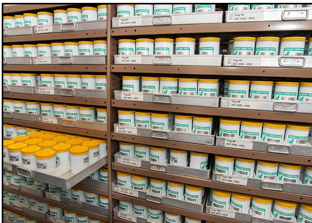
Gene Bank (seed storage)

understanding plant adaptations, developing conservation strategies, and addressing pressing ecological challenges. Additionally, seed banks collaborate with educational institutions to raise awareness about plant conservation and promote the importance of biodiversity.