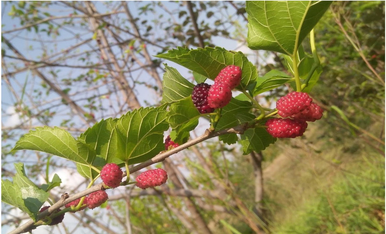
एम.अल्बा का फल