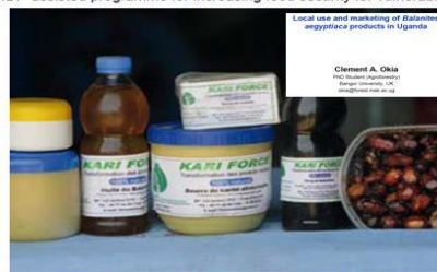
Oil used as a syrup for indigestion -costs US $ 12 per litre Oil also used to enrich soap, creams and lotions