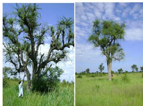
Trees with good (sweet) leaves are repeatedly cut