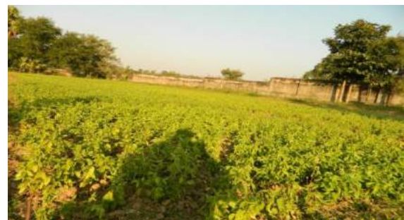
Fig. 1: Field view of horse gram

used as green manure. This crop is generally grown when the cultivator is unable to sow any other crop for want of timely rains and also grown in vacant space of orchard. Crop Status Horse gram is mainly cultivated in the states of Karnataka, Andhra Pradesh, Orissa, Tamil Nadu, M.P., Chhattisgarh, Bihar, W.B., Jharkhand, and in foot hills of Uttaranchal and H.P., in India. It is also cultivated in other countries mainly Sri Lanka, Malaysia, West Indies etc. During Twelfth Plan (2012-2015) in India, the total area under Horsegram and its production during this plan was 2.32 lakh hectares and 1.05 lakh tonnes respectively. In terms of area and production, Karnataka is on the first position on all India basis contributing 26.72% and 25.71% respectively followed by Odisha (19.46% & 15.48%) and Chhattisgarh (19.29% & 13.29%). The highest yield was recorded in the state of Bihar (959 kg/ha) followed by W.B. (796 kg/ha) and Jharkhand (603 kg/ha) (DES, 2015-16).