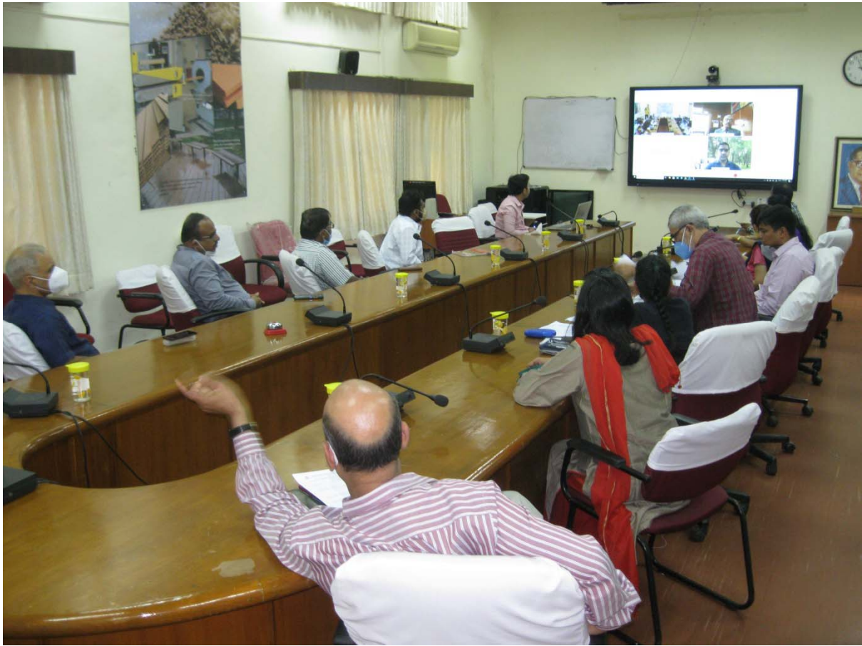
Photo 5: One Week Compulsory Training Course for IFS Officers' on "Practical steps for State Forest Departments for utilizing and developing forest genetic resources" (02-06 August 2021)