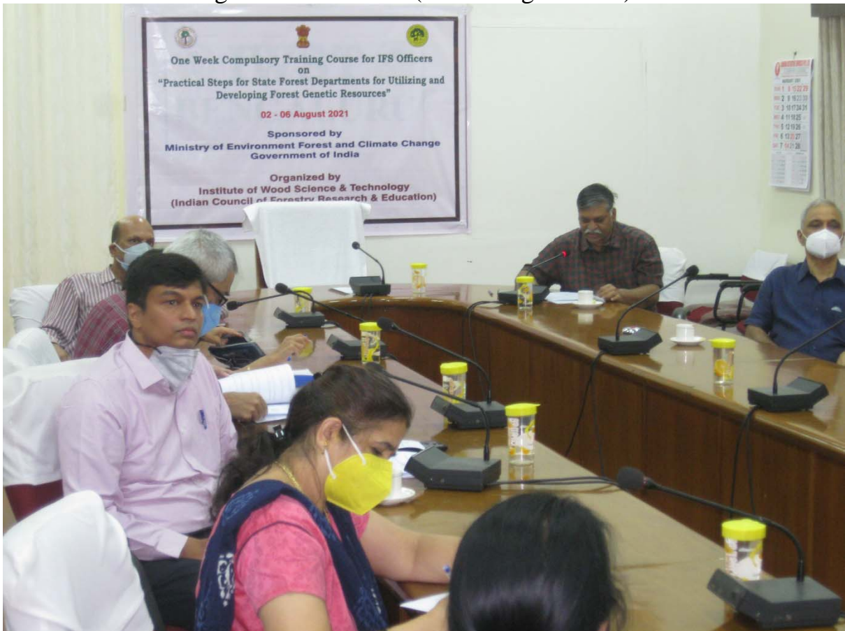
Photo 6: One Week Compulsory Training Course for IFS Officers' on "Practical steps for State Forest Departments for utilizing and developing forest genetic resources" (02-06 August 2021).