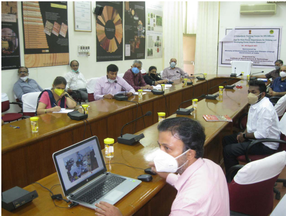
Photo 1: One Week Compulsory Training Course for IFS Officers' on "Practical steps for State Forest Departments for utilizing and developing forest genetic resources" (02-06 August 2021)