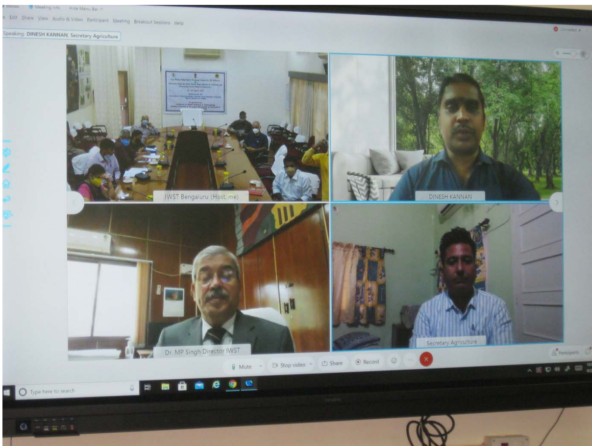
Photo 3: One Week Compulsory Training Course for IFS Officers' on "Practical steps for State Forest Departments for utilizing and developing forest genetic resources" (02-06 August 2021)