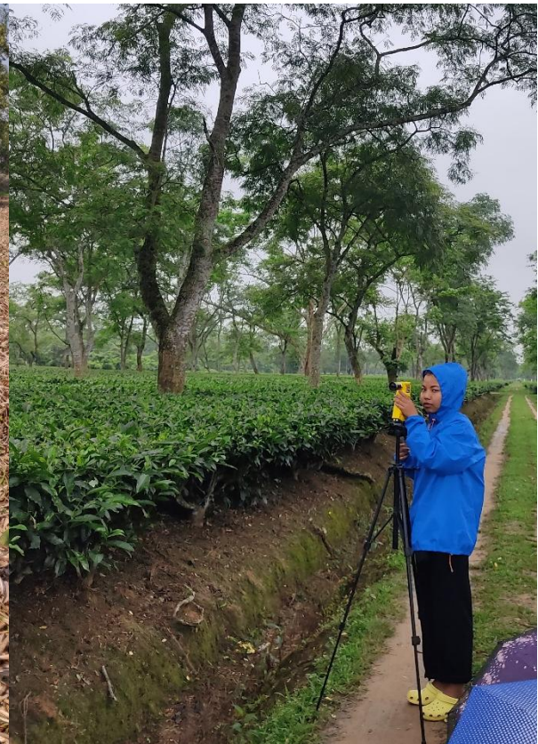
Use of Basal Area Factor Scope (Dendrometer) in measuring the trees