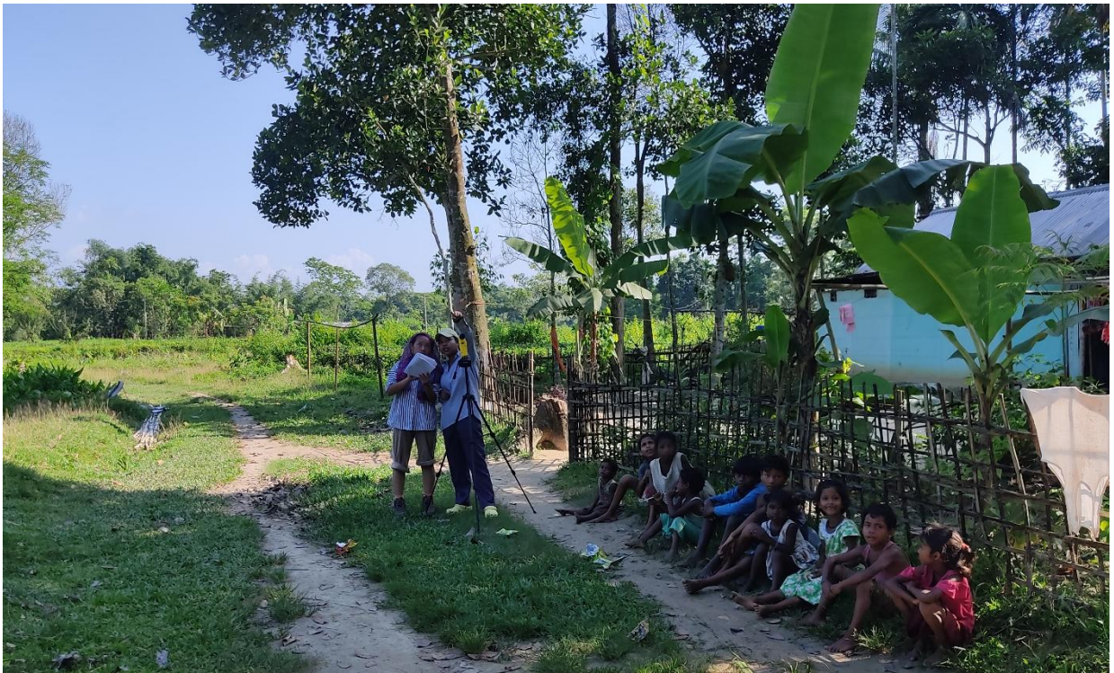
Measuring of trees in Tea garden and homestead areas