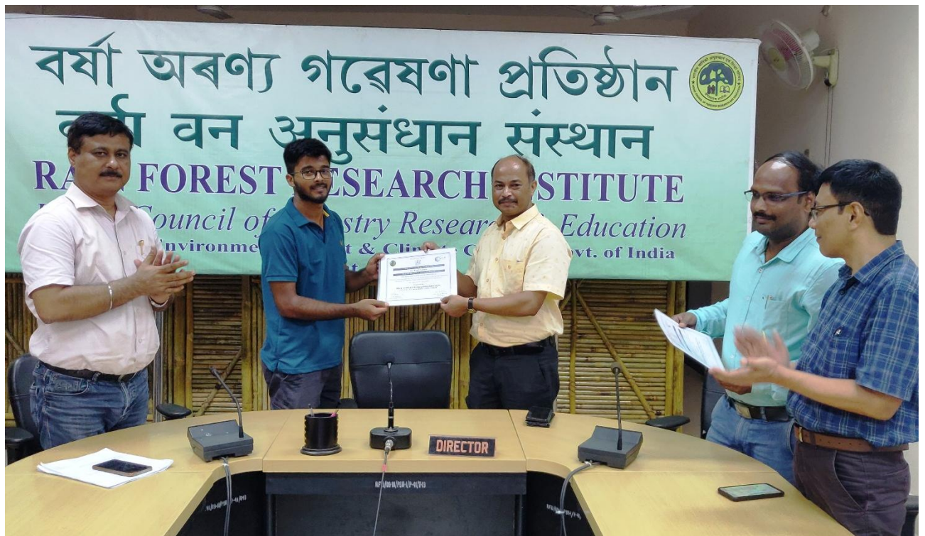
Certificate distribution to the Interns