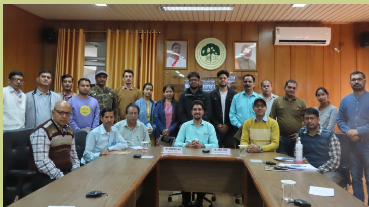
ICFRE, Dehradun conducted a Special Hindi Workshop