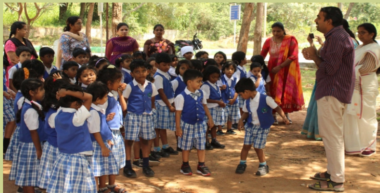
ICFRE-AFRI, Jodhpur organized an awareness programme about millets inclusion in diet through mid-day meal