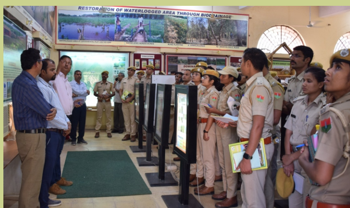
Forester Trainees of Forest Department, Jodhpur visited ICFRE-AFRI, Jodhpur