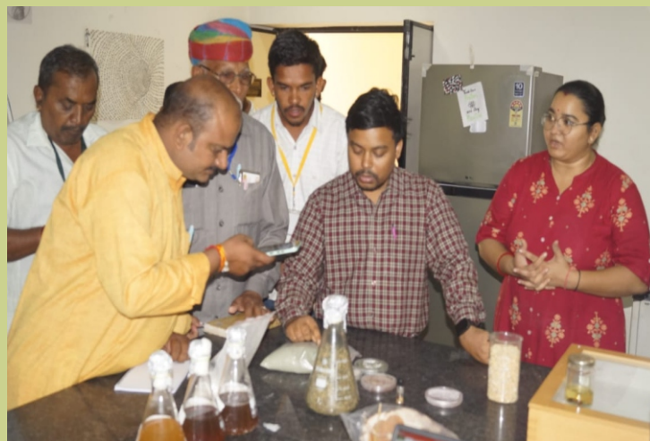
Greening of Arid areas and Sensitization on Ecological Aspect and Sustainable Forestry of Dry Areas