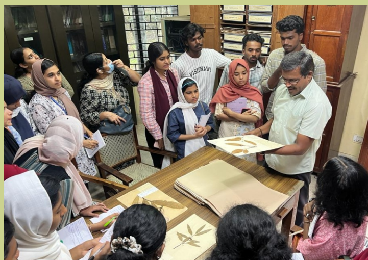
UG Botany students from Department of Botany, MES Ponnani College, Kerala, visited ICFRE-IFGTB, Coimbatore