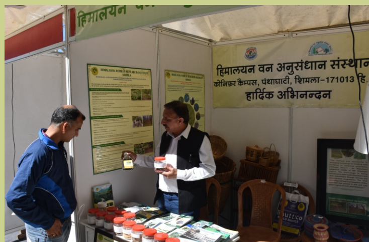
ICFRE-HFRI Shimla installed a stall in the Exhibition of Flying Shimla Fair