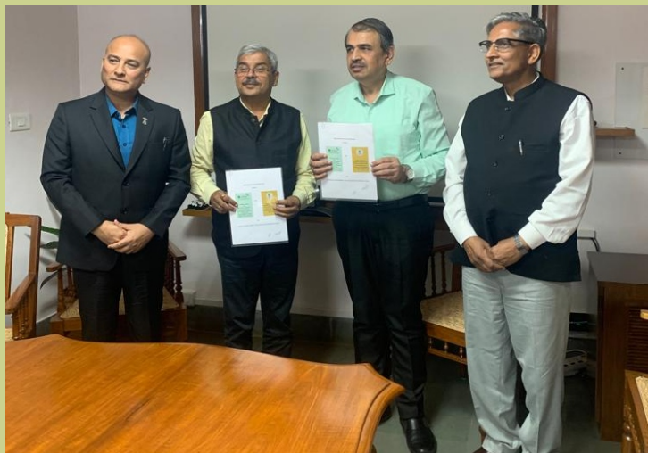
MoU signed between ICFRE-IWST, Bengaluru and NCBS, Bengaluru