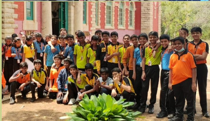
Students from various schools visited ICFRE-IFGTB, Coimbatore