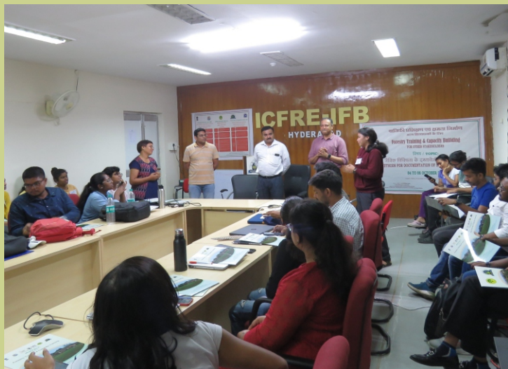
Methods for documentation of biological diversity