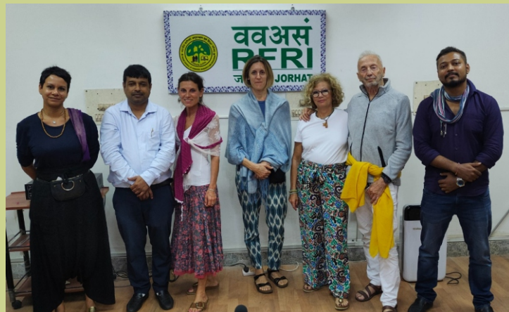
A group of representatives from various Perfumery Industries of France visited ICFRE-RFRI, Jorhat