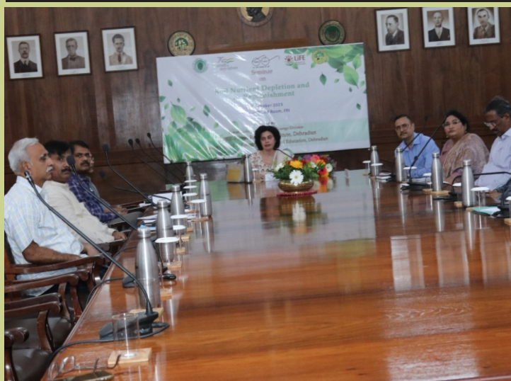
ICFRE-FRI, Dehradun conducted a seminar on Soil Nutrient depletion and its Replenishment