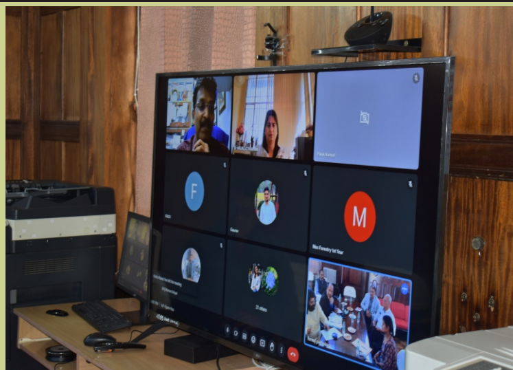
ICFRE-FRI, Dehradun conducted a Webinar on Bioinoculants for plant growth enhancement and disease resistance