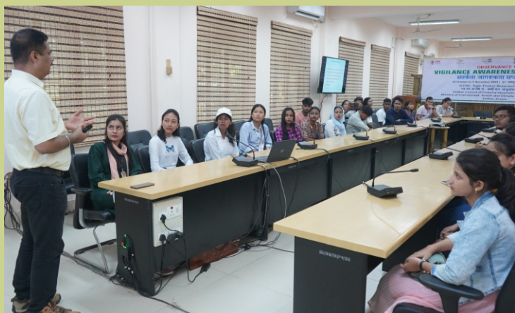
Botany (Honours) Students from Srikishan Sarda College, Hailakandi visited ICFRE-RFRI, Jorhat