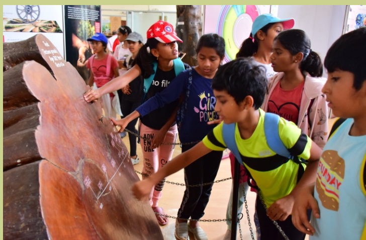
Students of Grade V and VI along with 03 teachers from Valiants Academy, Kanakapura Road, Bangalore visited ICFRE-IWST, Bengaluru