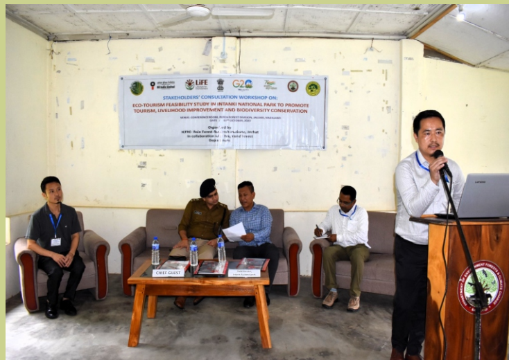
ICFRE-RFRI, Jorhat conducted a workshop on Ecotourism feasibility study in Intanki NP