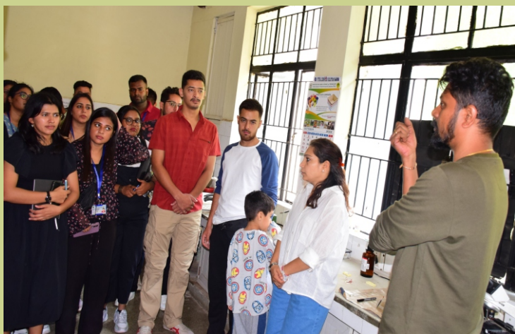
Students of M.Sc Environmental Science along with faculties from FRI Deemed to be University, Dehradun visited ICFRE-IWST, Bengaluru