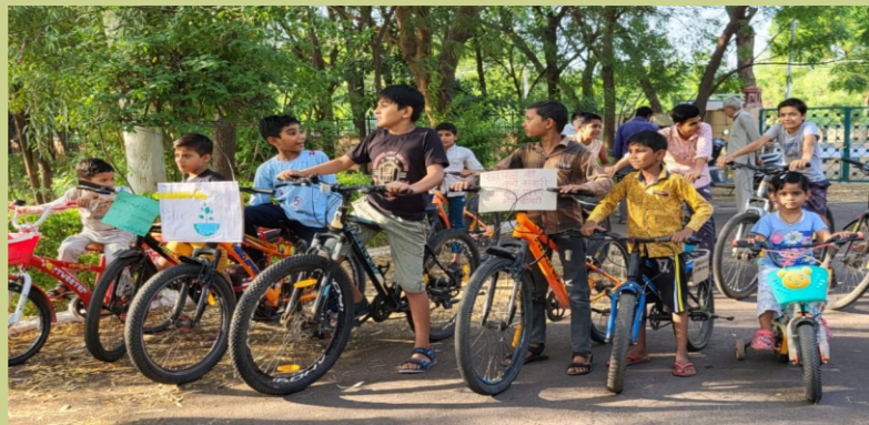
ICFRE-AFRI, Jodhpur organized a Children's Cycle Rally programme