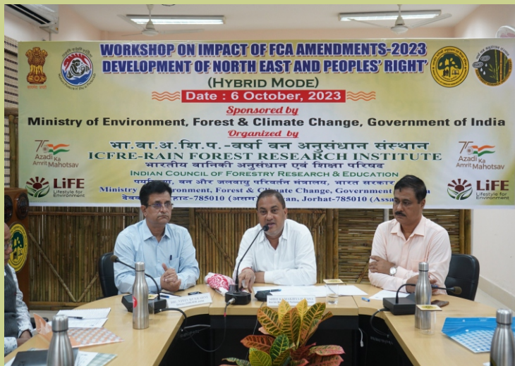
ICFRE-RFRI, Jorhat conducted a workshop on Impact of FCA Amendments on Development of North East and People's Right