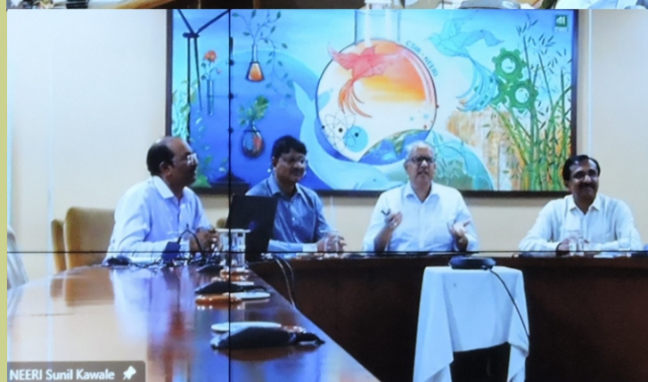
MoU signed between ICFRE, Dehradun and CSIR-NEERI