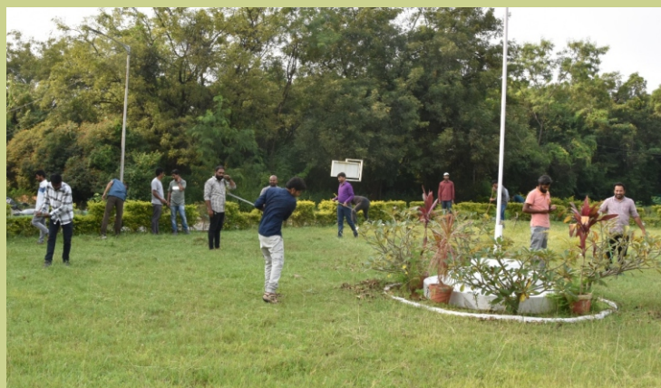
ICFRE-IFB, Hyderabad conducted cleanliness programme