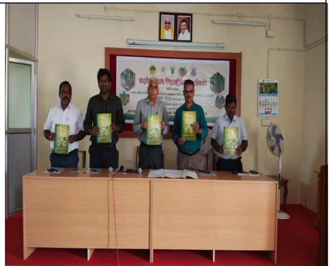
Release of Training Manual