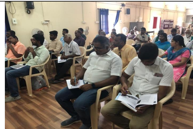
Participants viewing the training manual & posters