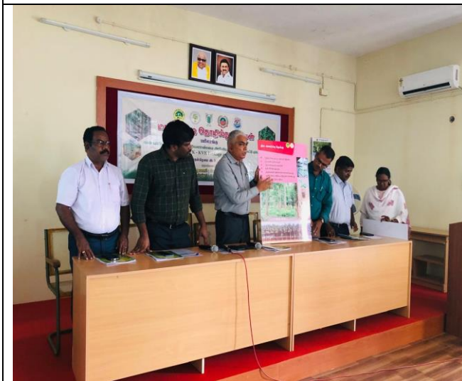
Handing over of Tree Cultivation technique posters to KVK, Pongalur