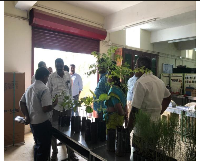
Participants observing our ICFRE-IFGTB Clones