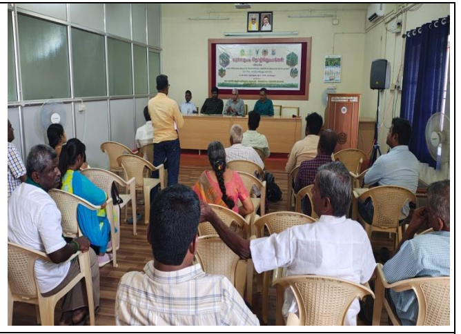
Farmers interaction during the training