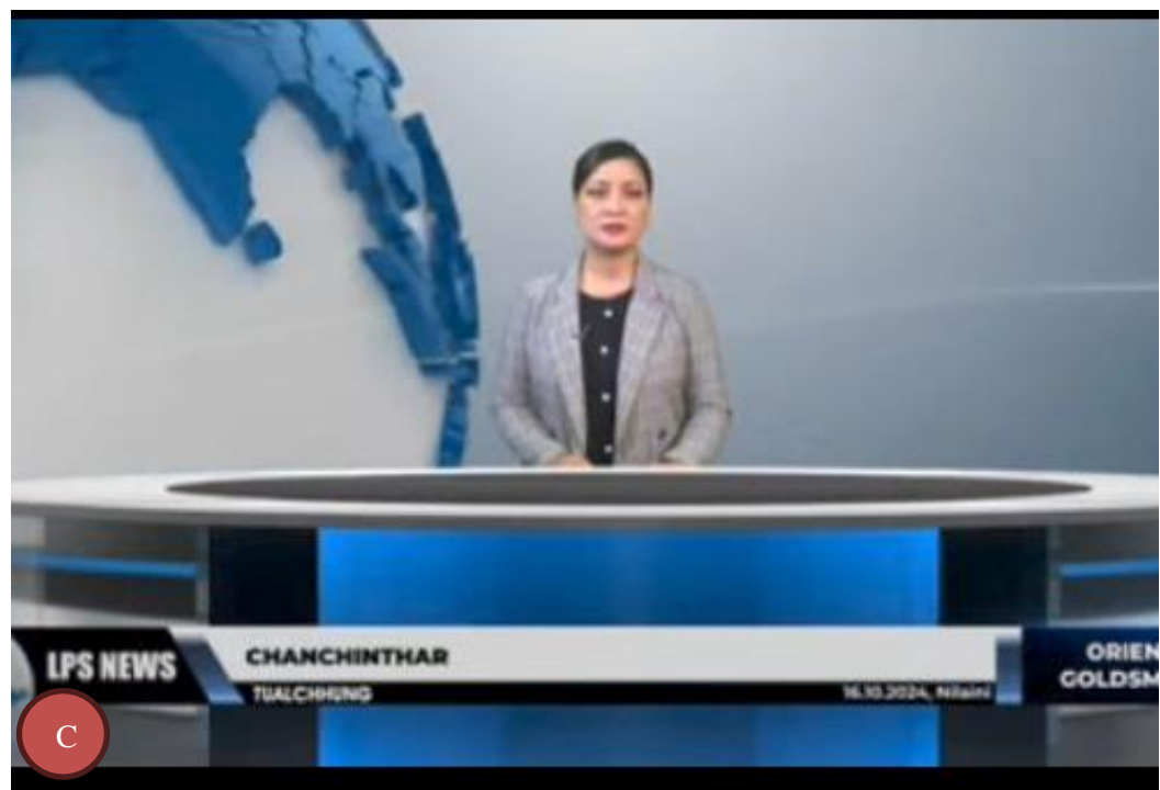
Pic-C: 'LPS News' Electronic Media